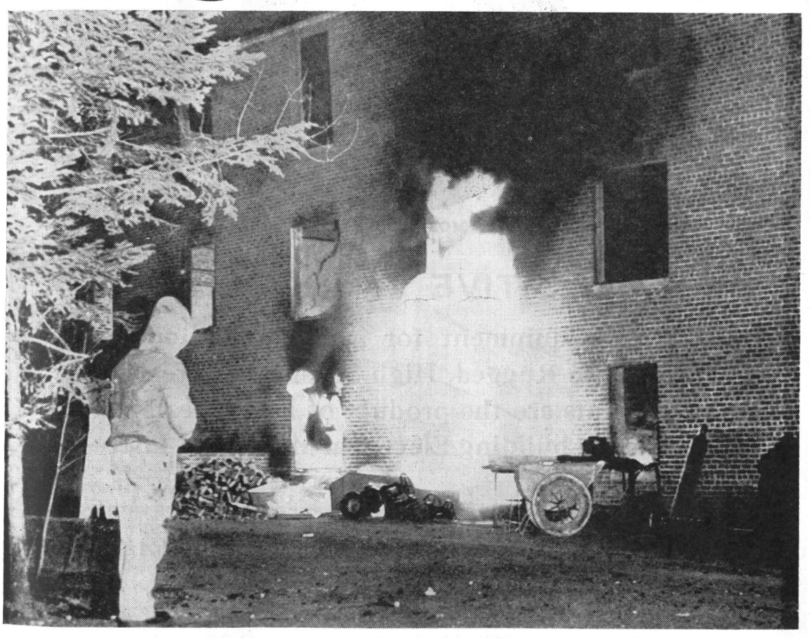
The Roscoe B. Jackson Memorial Laboratory for Cancer Research burning early on the morning of October 24 as a bystander watches helplessly (see Science , October 31).