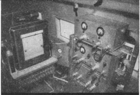
Speedomax in Plane Logs Surveys-Aero Service Corp.