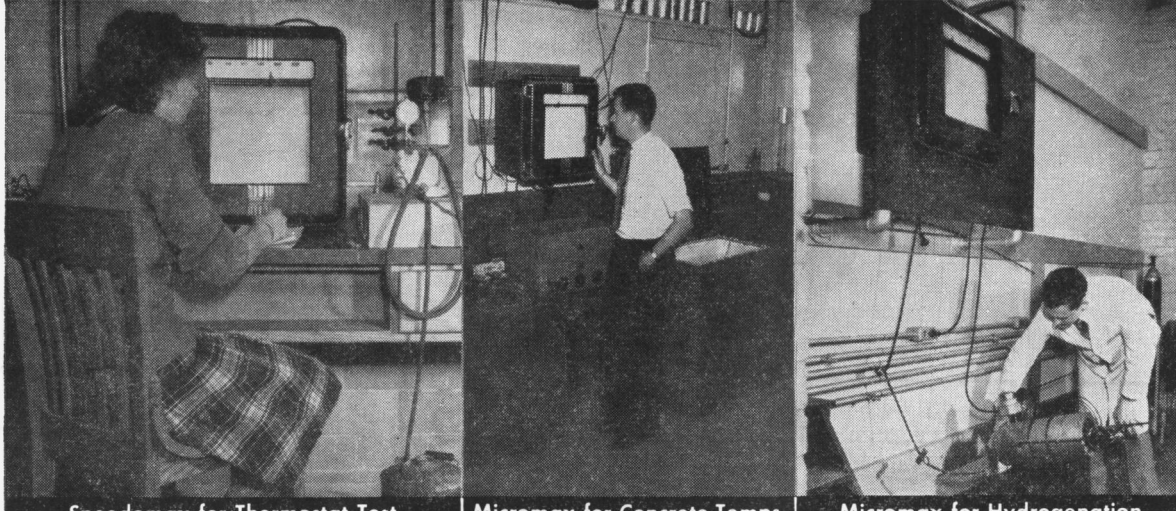
Speedomax for Thermostat Test Temperatures—Vernay Laboratories, Inc.