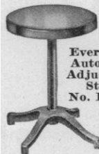
Ever-Hold Automatic Adjustable Stool No. E-1824

If you do not have a copy of the Kewaunee Catalog of Laboratory and Vocational Furniture, write today.