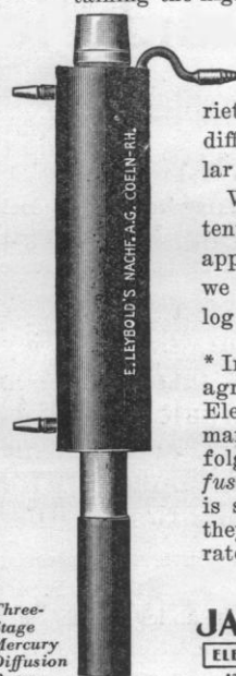
Three-Stage Mercury Diffusion Pump

*In consequence of a license agreement between the General Electric Company and the German makers (E. Leybold's Nachfolger), the sale of Gaede's Diffusion Pumps in the United States is subject to the provision that they shall be used only for laboratory and experimental purposes.