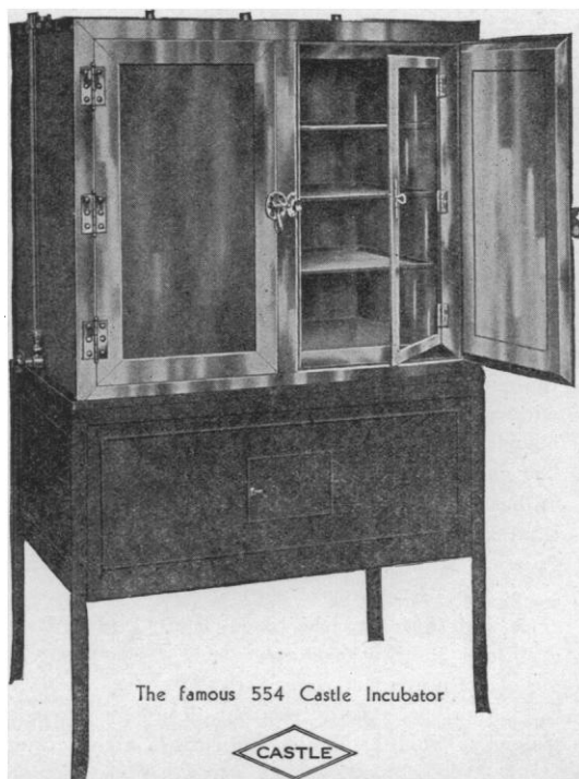
The famous 554 Castle Incubator