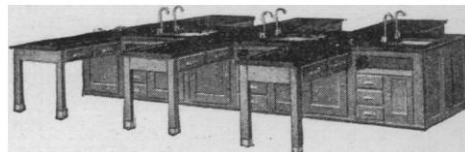
Lincoln Science Desk No. D-540