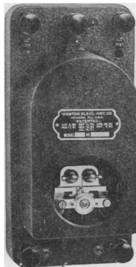
Model 30 Relay

T HE efficiency and reliability of Photo Cell apparatus in the majority of applications depends upon the reliability of the Relay which transforms the minute electrical impulses into action-producing electrical energy.