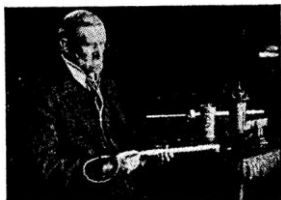
Vibrations of An Electric Buzzer. Testing the Pitch of Her Voice.

For Measuring Sound Waves, Testing Number of Vibrations in Musical Notes