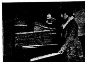
Tuning Her Piano.

May be used for synchronizing sound in the vibration of machinery, or in other sounds