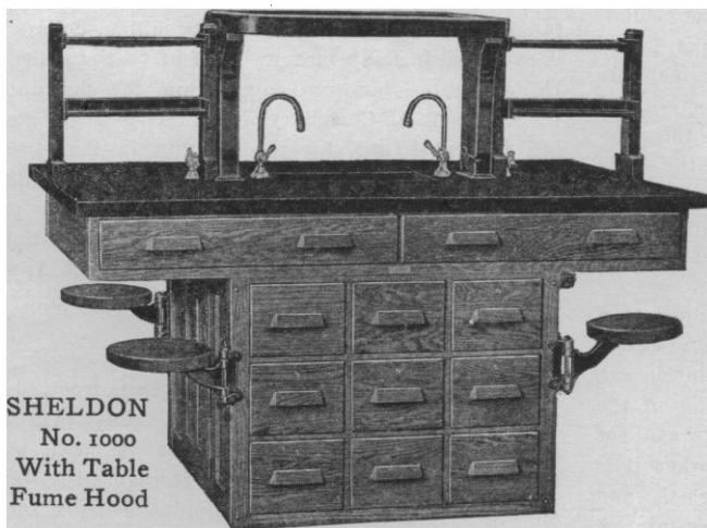
SHELDON No. 1000 With Table Fume Hood

For over 30 years we have been building an organization of trained personnel and perfecting the details of design, construction and finish incorporated in our product. Our entire resources and facilities are devoted exclusively to building and installing the most durable, practical and attractive laboratory furniture that experienced designers, skilled artisans and research experts can produce.