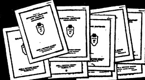
PHOTO-ELECTRIC CELLS THE BURT CELL

LEEDS & NORTHRUP CO. 4901 STENTON AVE. PHILADELPHIA, PA.