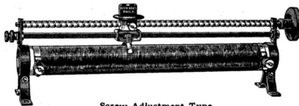
Screw Adjustment Type

"BECBRO" Rheostats carried in stock include numerous different ratings.