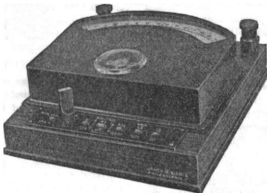
Siemens & Halske Precision Volt-Ammeter with seven ranges