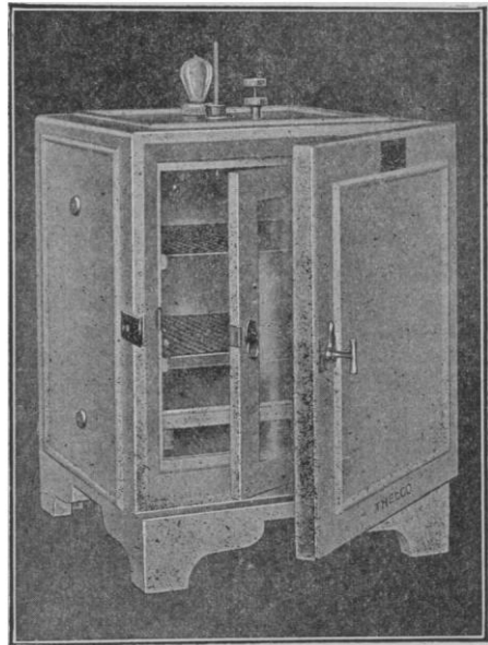
THELCO INCUBATOR NO. 2

Ideal for the individual doctor's office. Write for pamphlet. THE THERMO ELECTRIC INSTRUMENT CO. 8 JOHNSON STREET, NEWARK, N. J.