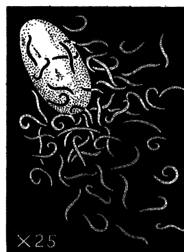
FIG. 2. Cucumber-beetle egg and the charge of nemas deposited with it.