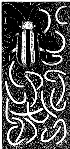
FIG. 1. Shows relative volume of beetle and parasites. The line XY shows the actual length of the beetle.

paratus, of the host, and so becoming deposited with the eggs of the latter.