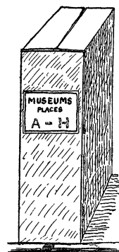
FIG. 2. The pamphlet-case closed as it stands on the shelf.

with a white paper label on which the subject is stencilled in black, while the letters contained in that particular box are marked in broad soft pencil, easily changed as required (see Fig. 2).