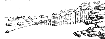
THE STRAIGHT LINE PARTS SUNSHINE & SHADOW.

But the strange question arises, what was the real height of the film-clouds? Must they not, obviously, have been at a lower level than this portion of the thunder-cloud, though higher than the main mass? And yet portions must have been piled higher against the thunder-cloud. Else there could not have been the illuminated space dividing the shadow from the cloud. In some cases the dark bars merged into sheets of shadow, which stretched away 20° or more from the cloud. Apparently, if seen in section, the effect must have been as in the appended sketches.