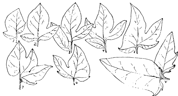
LEAFLETS FROM THE AILANTHUS TREE.

Nos. 5, 6, and 7 are certainly extremists. They may, perhaps, be compared with the impulsive, rampant reformers in the social world, who are imbued with a stronger progressive impulse than will harmonize with existing conditions; whose wishes to surmount all obstacles and soar aloft lead judgment and reason astray. The time is not ripe for