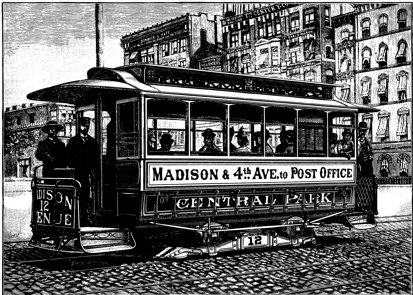
FIG. 3.—STANDARD ELECTRIC CAR, JULIEN STORAGE BATTERY SYSTEM.

which he could quickly determine whether any specimens of quartz contained gold, by simply crushing it with a hammer and running it through the machine. The mechanism of this apparatus consists of an inclined ladder with fine wire cloth upon one side and silk upon the other. A blast of air is passed up and down through the two meshes, blowing off the light particles of dirt and quartz and allowing the free gold to be retained simply by gravity. Another machine is adapted for concentrating various metals from rock, such as sulphates of copper, lead, zinc, and antimony, making the future separation of the valuable metals from the metallic mass, by roasting or chemical processes, an easy matter. During the exhibit an interesting experiment was made to show the value of the machines, and the thoroughness with which they performed their work. The machine used in the experiment weighed about five hundred-weight, and was so compact that it could be readily