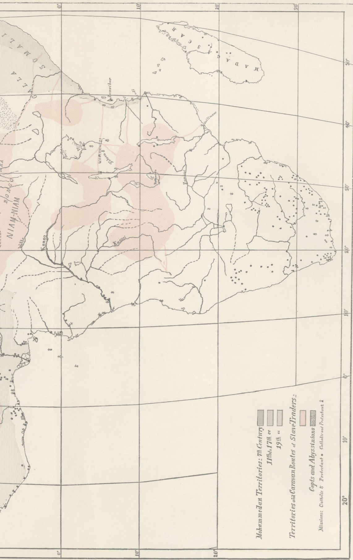
MAP OF AFRICA, Showing the Spread of Mohammedanism and the Extent of Slave-Trade.