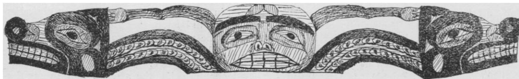
FIG 2. — DANCING-IMPLEMENT, REPRESENTING THE SISIUTL.