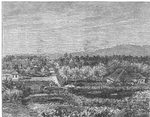
TELOK-BETOENG BEFORE THE ERUPTION.

tinuing the voyage, the travellers arrived at the island of Sebesie, and here the destruction was complete, — hardly a bit of herbage, hardly a trace of life, remained. A coat of gray cinders mixed with pumice,