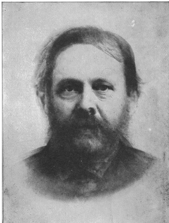
FIG. 2. — SIXTEEN NATURALISTS.