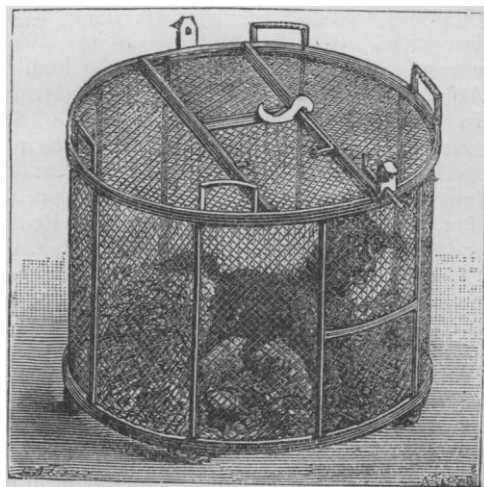
CAGE FOR A MAD DOG.

packed phials, containing such precious gifts, by foreign savants , as yellow-fever secretions from Brazil, or possibly cholera-germs from