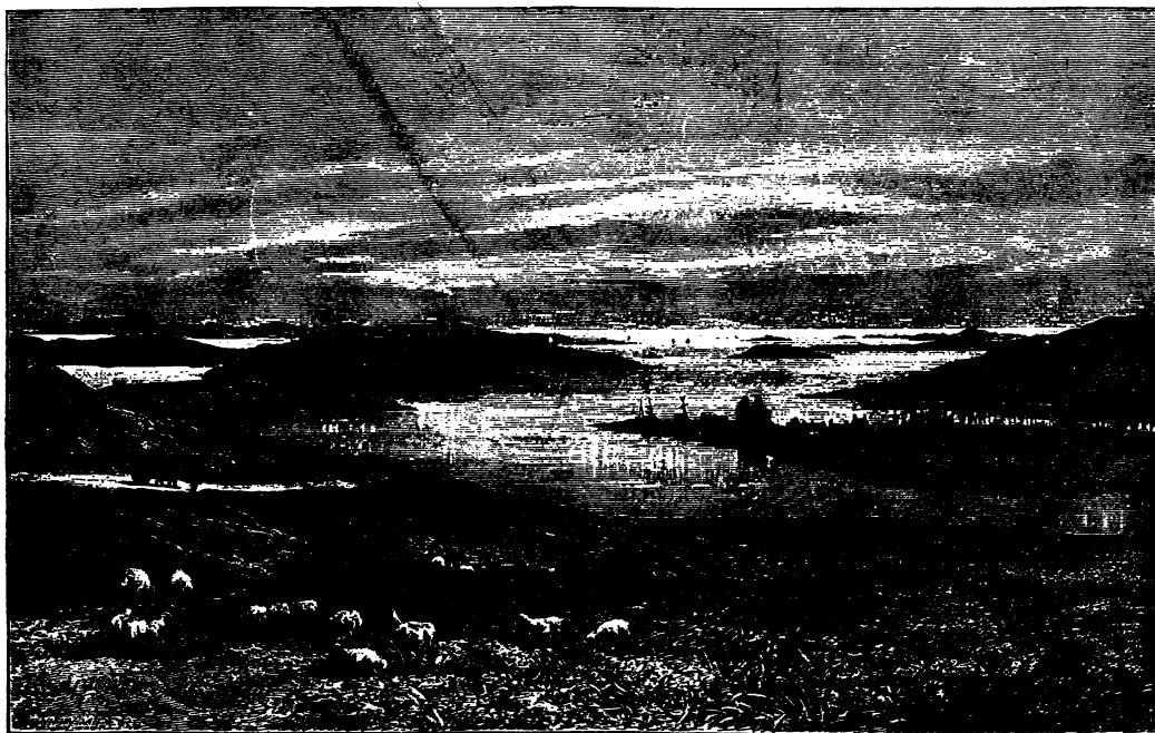
SCALLOWAY FROM THE NORTH-EAST.