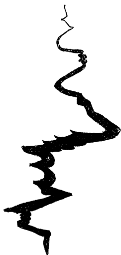
FIG. 2. — From 2 to 3 minutes after explosion.

Then came the most wonderful part of the phenomenon; for, at the point in the heavens where the meteor burst, there appeared a figure like the shape of an immense distaff, all aglow with a bluish-white light of the most intense brilliancy. It kept that form for perhaps two minutes, when it began to lengthen upwards, and grow wavy and zigzag in outline from the action of the wind, and gradually diminishing in breadth, until it be-