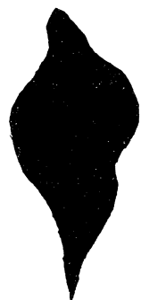
FIG. 1. — Directly after explosion.

The sun had set clear, leaving the lower sky streaked with gorgeous tints of green and red, while the new moon, three days old, gave out a peculiar red light of singular brilliancy. Suddenly, at three minutes before five o'clock, a loud rushing noise was heard, like that of a large rocket descending from the zenith with immense force and velocity. It was a meteor, of course; and when within some 10^{\circ} of the horizon it exploded with great noise and flame, the glowing fragments streaming down into the sea like huge sparks and sprays of fire.