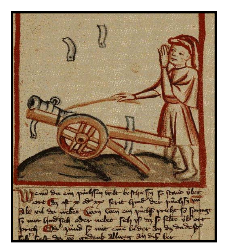
Figure 3: Warning of the danger that a cannon might explode, from an early fifteenthcentury cannon maker's manuscript book.