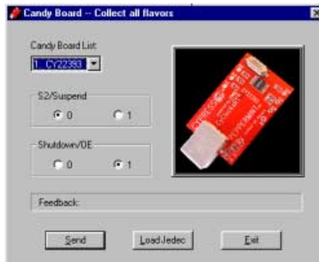
Figure 1. Candy Board Set-up Window

Windows is a trademark of Microsoft Corporation. CYClocksRT™ is a trademark of Cypress Semiconductor Corporation. All product and company names mentioned in this document are the trademarks of their respective holders.