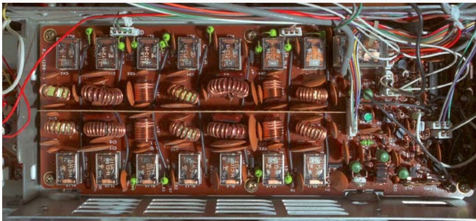
Relay-switched Low-pass filters used to remove harmonics from the transmitter output.